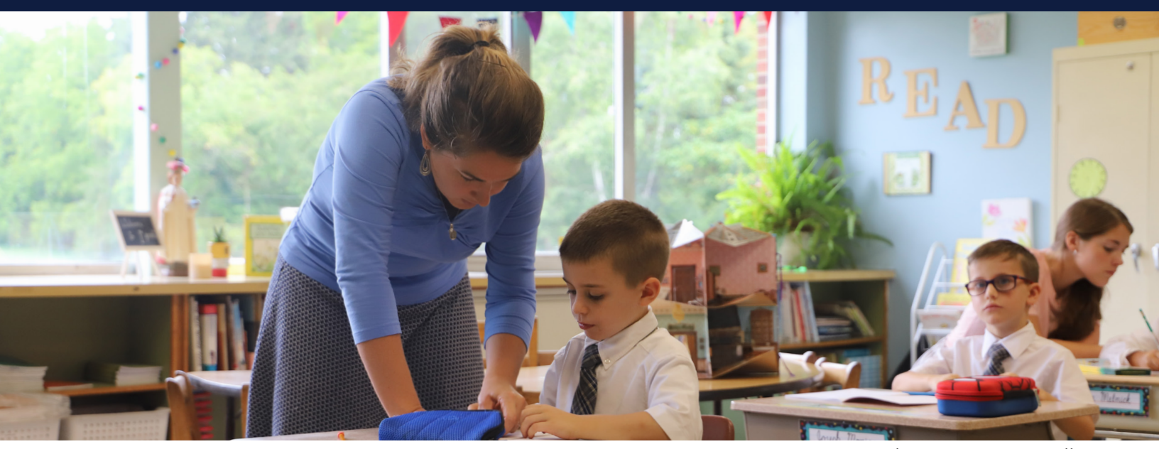
Vol. XVIII, Issue III: Fall 2022