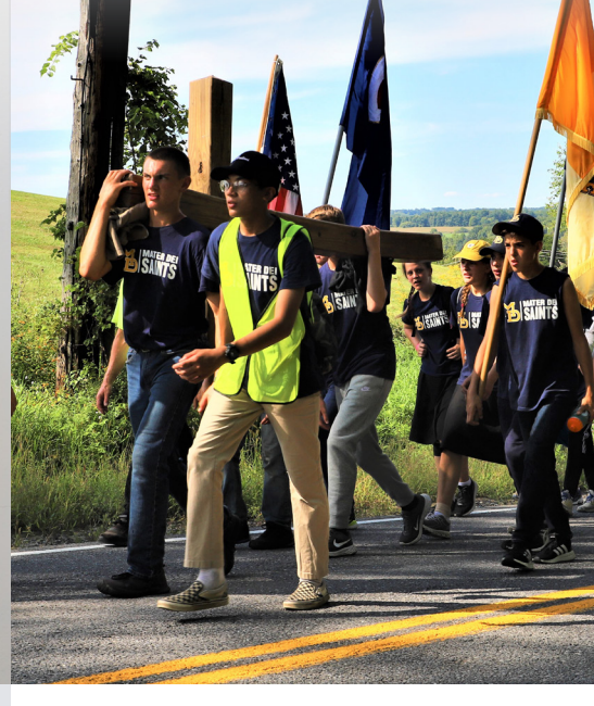
September 15<sup>th</sup> Jog-a-thon Kick-off St. Philomena, help us!

September 8th-10th Auriesville Pilgrimage