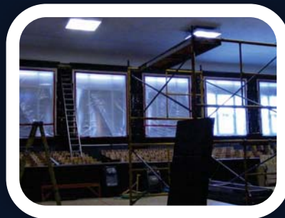
The new windows being installed in the gym along with the new walls.