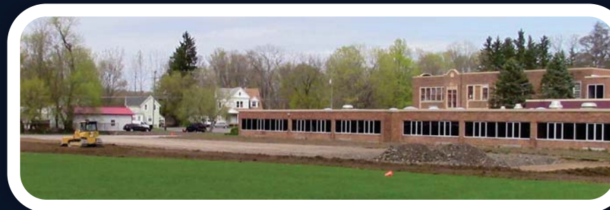
The bulldozer spreading tons and tons of gravel for our new parking lot over Easter Week.