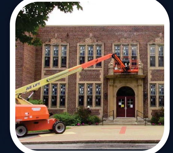
New windows being installed above the entry way of the Academy.