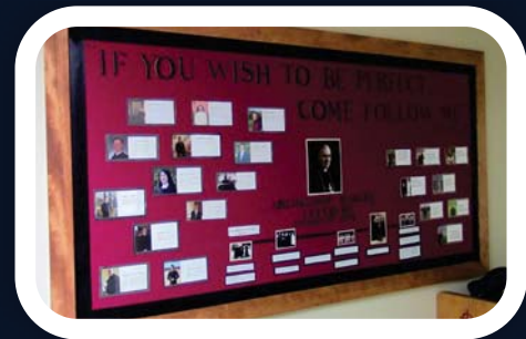
The new Vocations' Board in the Chapel hallway, asking for prayers for all our priests, seminarians, brothers, and sisters.