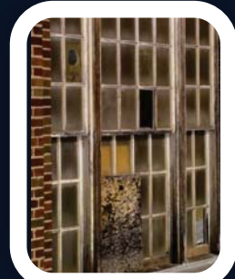
The old single-paned (or in some cases, no-paned) windows, which besides letting much heat out, were terribly ugly.