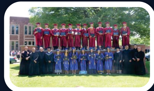
The Class of 2019 poses for a picture with priests and principals, current and former.