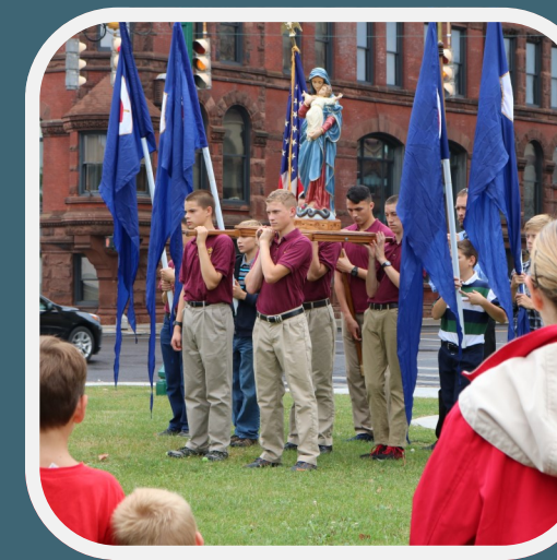
The High School boys joyfully carrying Our Lady's statue at the Rosary procession through Syracuse.