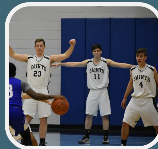
The Boys Varsity basketball team playing stiff defense.