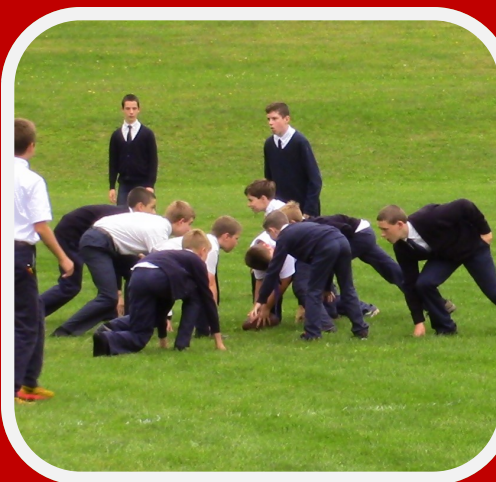
The middle school boys enjoying some healthy recreation during recess.