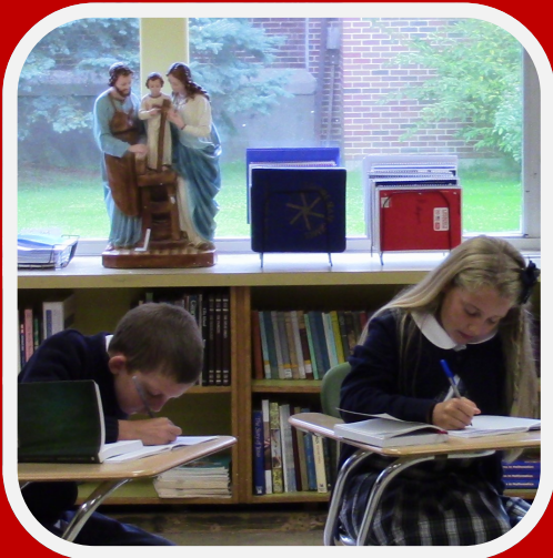
Fifth-graders hard at work learning their grammar lesson.