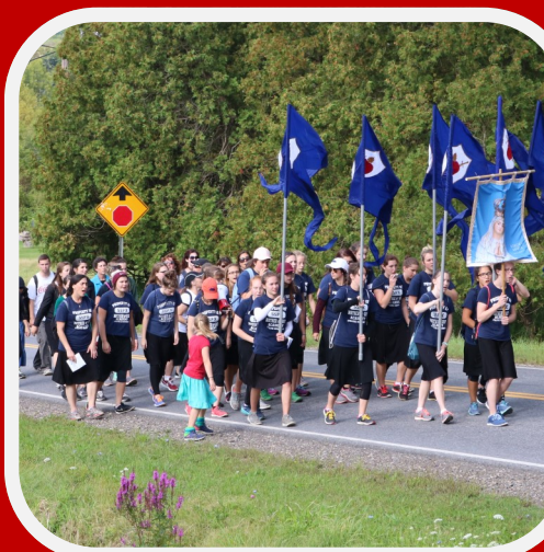
The High School Girls chapter ascending the hill at Auriesville.