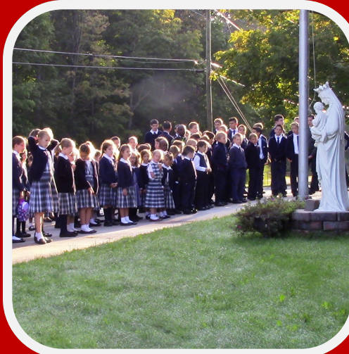
The K-8th graders gathering before Our Lady for morning line-up.