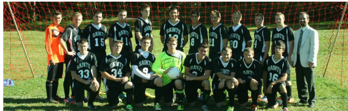
Below: The winning team, fall 2013.

A high school of 60 usually wouldn't compete against a high school of 2600 students. Even if they did, they certainly shouldn't have much chance of winning. That was the case for the first eight years of Mater Dei Saints' history. Time and again, our humble teams would win the victory over more powerful foes. One landmark case occurred in 2013 against a long time rival. Utica Proctor (a high school of over 2600) was happy to use our boys as a little in-season tune-up. Maybe they could practice their formations and work on their passing before they played more serious competition.