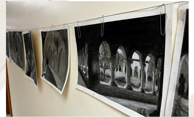
High school boys explore the use of charcoal while studying architecture and perspective.