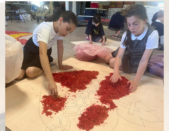
Fourth grade girls prepare a sawdust design for the feast of Corpus Christi.