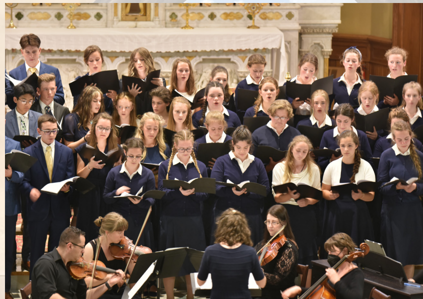
The high school joined The Holy Name of Jesus Academy to sing the praises of Our Blessed Mother in the Magnificat Concert.