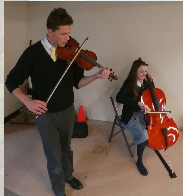
Seniors prepare for a busking trip to Pittsburg.