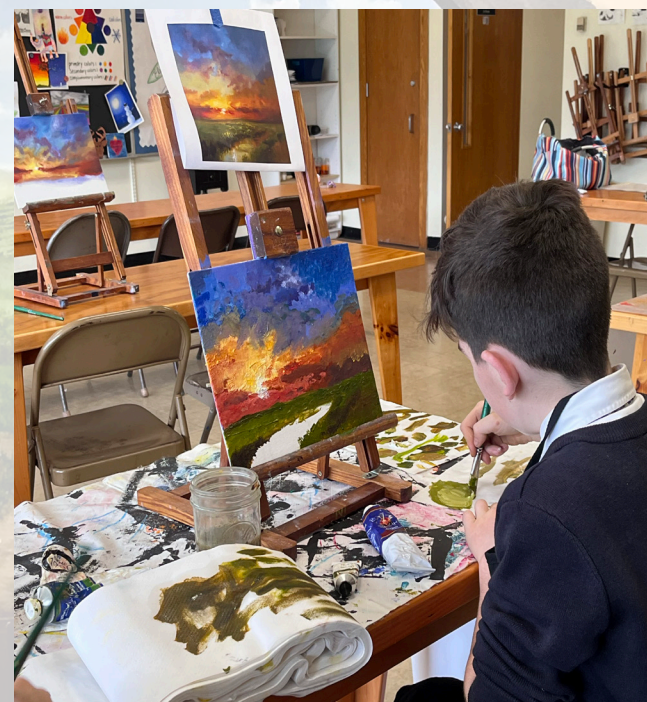
Sixth graders dabble with oil paint for the first time.