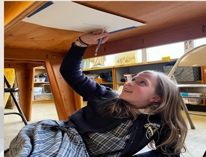
A fifth grader has a little more compassion for Michelangelo after copying his style of painting the Sistine Chapel.