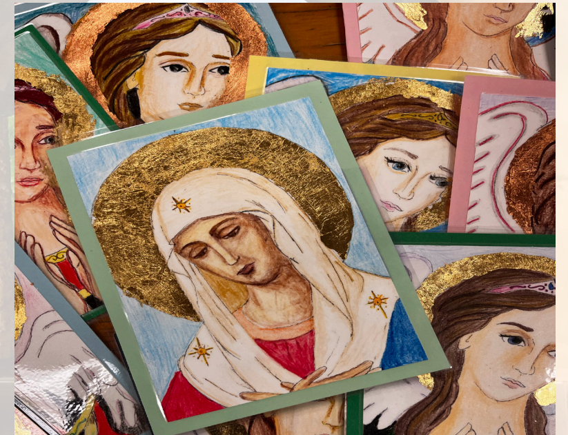
Fifth grade students study Fra Angelico and replicate his portraits using colored pencils and gold leaf.