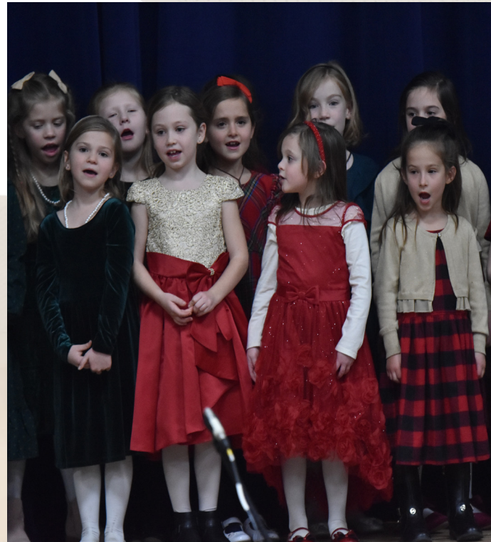
First & second grade girls sing their piece for the annual Christmas Concert.