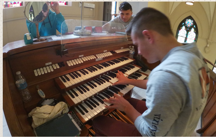
When the opportunity for playing an organ presents itself, you take it, as did this happy boarder.

The purpose of true education is to help the student love God. By being shown the order and beauty of creation, the student learns of God’s love for him. Studying good music fosters a love of beauty, which in turn cultivates a knowledge and love of the good God whose creation is filled with order and beauty.